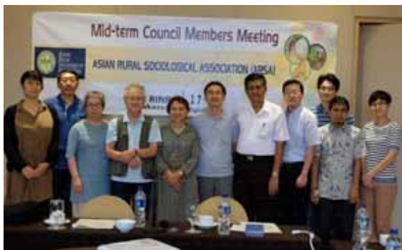
Group photo at the Council Meeting

# Student membership fee (1/2 of Full membership): US$15/10/5