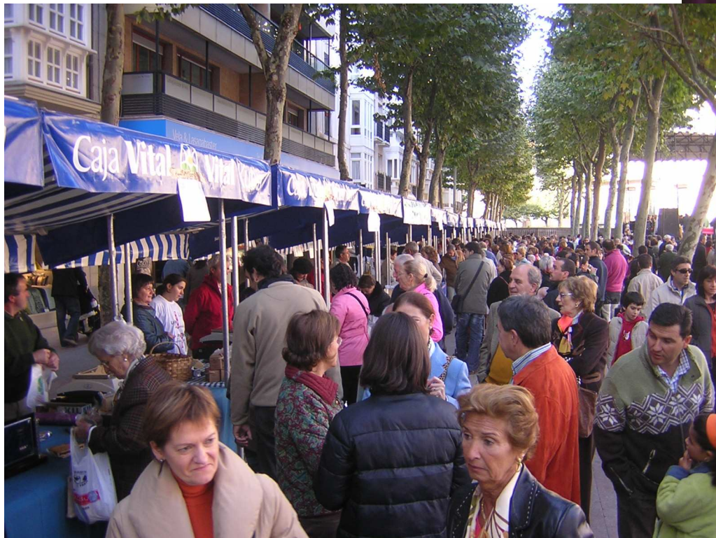
"Shepherd's cheese competition" Vitoria, October 2007